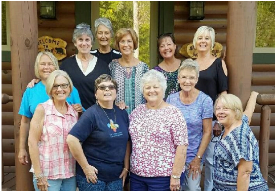
L.I.N.C.S. Ladies "Rock"

CWF Fall Rummage Sale will be Saturday, Oct. 21st. If you have items to donate please bring them in by Friday, Oct. 20th.