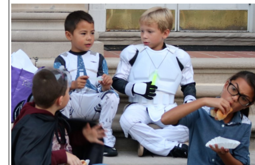
Halloween 2016 Fun was had by all ages.