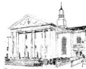
Disciples of Christ