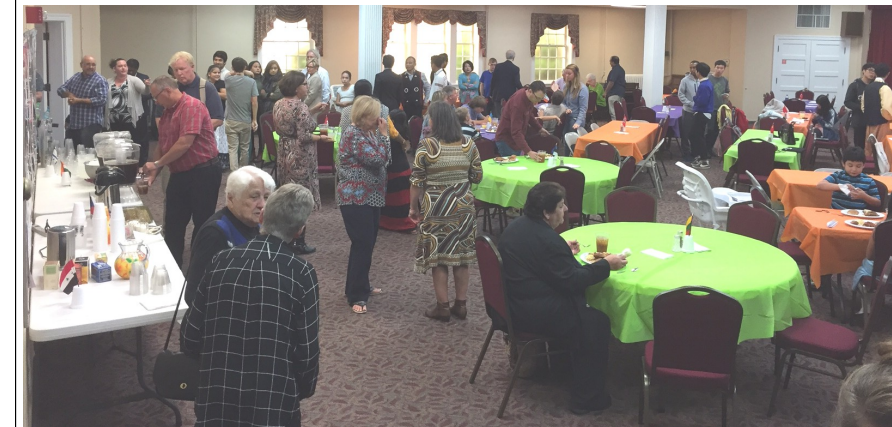
World Communion Sunday Luncheon Oct. 2, 2016