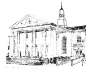
Disciples of Christ

The next TGMG meeting is Saturday, April 1st at 8:30 a.m. at Cloud's Country Cooking for breakfast. All men are invited.